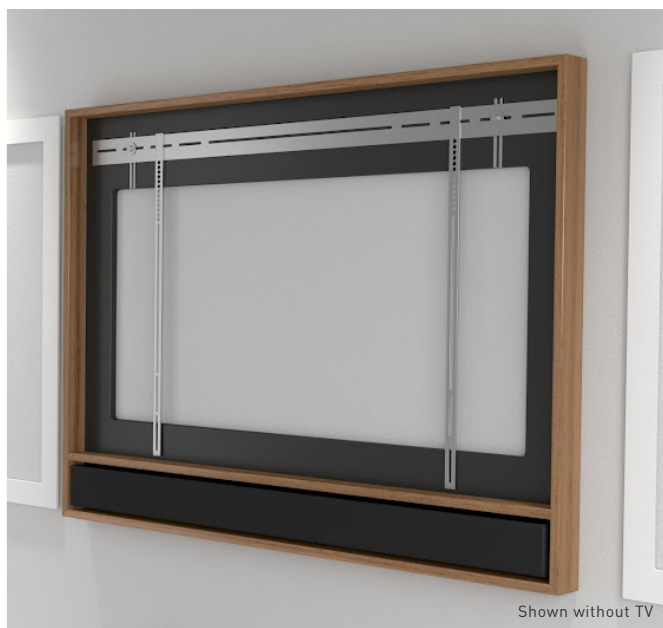
Shown without TV

Leon's Edge is a custom A/V solution with the finished look of a sleek media frame. Each Edge is custom built to house any display and our ultra-thin soundbars, concealing all borders and cables in one simple design. With multiple points of adjustment and self-leveling capabilities, the Edge provides an elegant audiovisual solution that will truly compliment any environment.