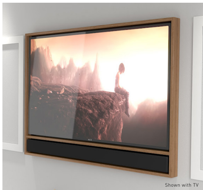
Shown with TV